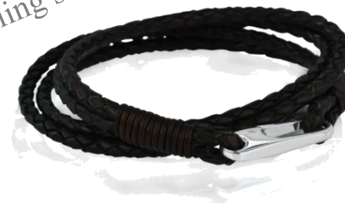
CABALLO REINS BRACELET

Leather bracelet with a Sterling Silver clasp Wraps around the wrist twice Brown BR308BR