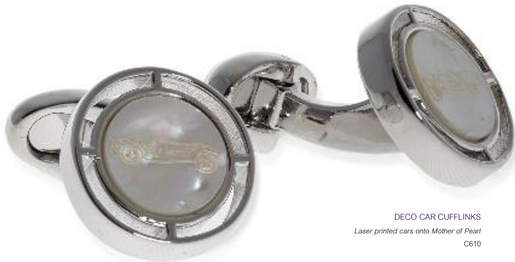
DECO CAR CUFFLINKS

Laser printed cars onto Mother of Pearl C610