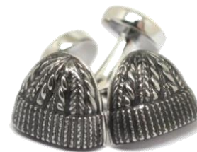
WOOLLY HAT CUFFLINKS