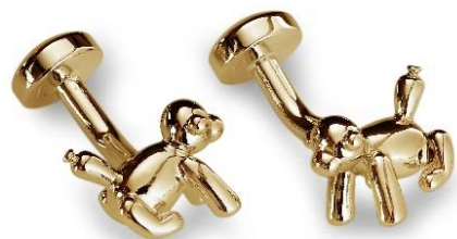
BALLOON MONKEY CUFFLINKS

Plated with precious metals Rhodium C633RH Gold C633YG