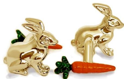
RABBIT & CARROT CUFFLINKS Hand enamelled and plated with precious metals Rhodium C740RH Yellow Gold C740YG