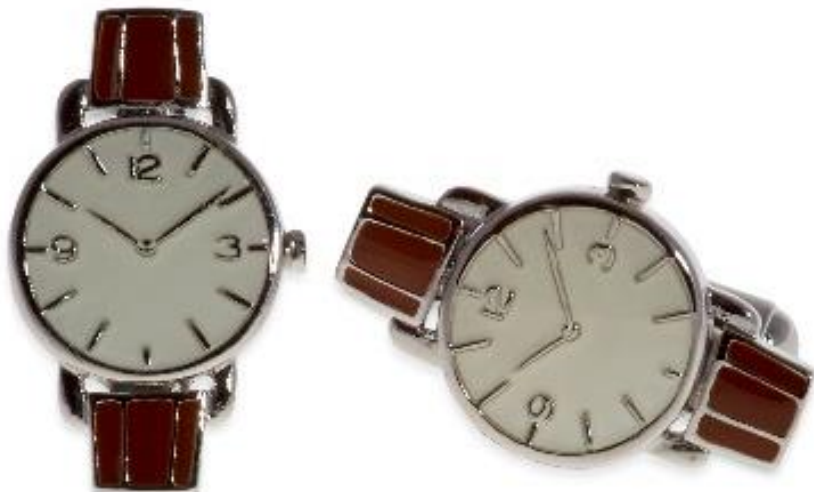
RETRO WATCH CUFFLINKS