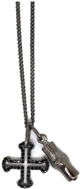
CROSS & BAMBOO NECKLACE Black Antique and Swarovski NS435BK Antique plated acrylic NS435AN