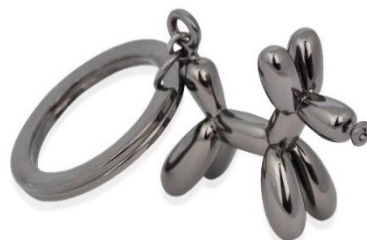
BALLOON DOG KEYRINGS

Rhodium plated Rhodium K012RH Black Rhodium K012BK