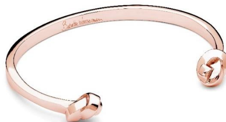
KNOT CUFF BRACELET

Brass bracelet plated with precious metals