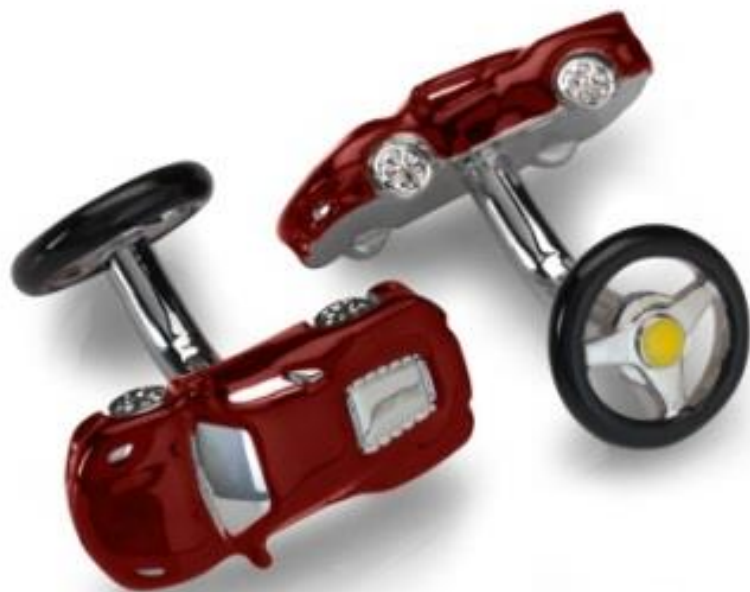
SPORTS CAR CUFFLINKS Hand enamelled Rhodium plated Red C567RD Black C567BK