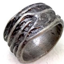
BIKER BAND RING Antique black Rhodium plated finish RG264