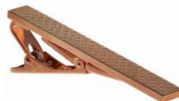
CLOVER TIE BAR

Plated with precious metals Black rhodium C726BK Black TB036BK Rhodium TB036RH Rose Gold TB036RG