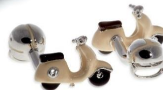
RETRO VESPA & HELMET CUFFLINKS Hand enamelled Rhodium plated Light Blue C52LB Cream C521CR