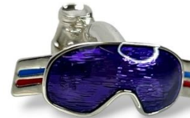
SKI GOGGLES & BOOTS CUFFLINKS Hand enamelled plated in Rhodium C745