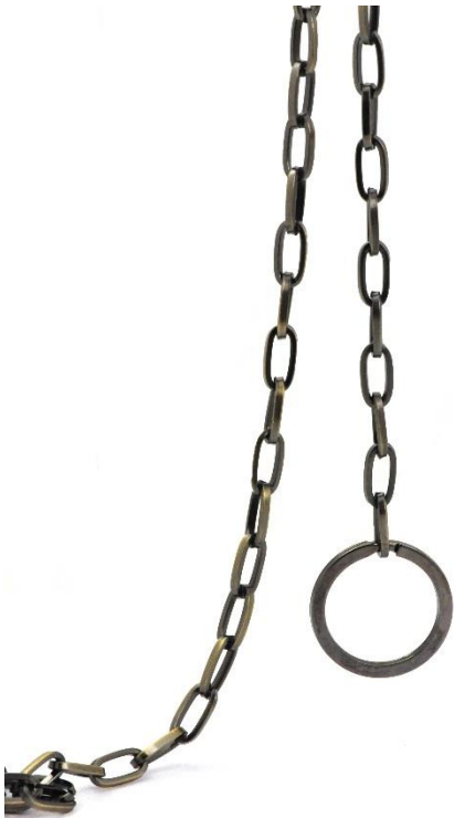
LINK FOB CHAIN

Sterling Silver plate with an antique finish K019BK