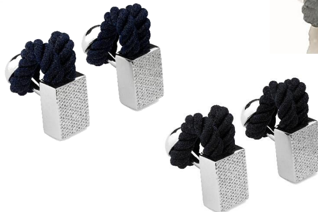
ROPE WRAP CHECK CUFFLINKS Japanese Silk wraps around your sleeve Wine C711WI Navy C711N Black C711BK Light blue C711LB