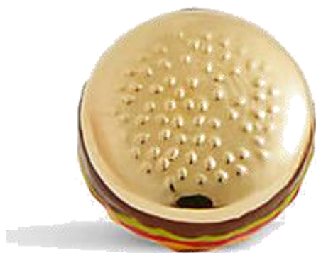
BURGER AND FRIES CUFFLINKS

Hand enamelled plated in Yellow Gold C737