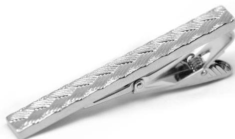
ROMAN TIE BAR Woven texture Rhodium TB035RH