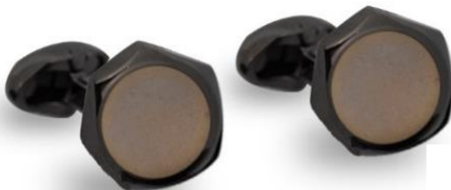
HEXAGON BUTTON CUFFLINKS Matt and shiny finish Black Rhodium C635BK Rose Gold C635PG