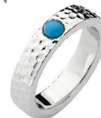
INDIANA RING Antique black Rhodium plated finish with semi-precious stones Turquoise RG268TU