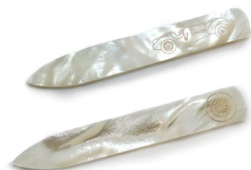
DECO CAR COLLAR STIFFENERS

Plated with precious metals Rhodium C694RH Rose Gold C694PG