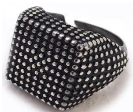
BIKER SIGNET RING Antique black Rhodium plated finish RG266