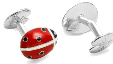
LADYBUG CUFFLINKS Hand enamelled, plated in rhodium Red C732RD Blue C732BL