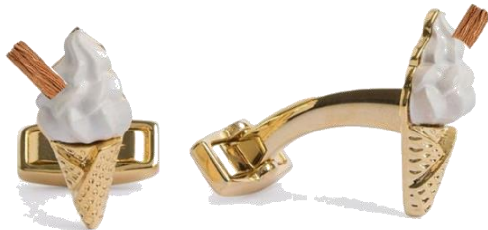
ICE CREAM & FLAKE CUFFLINKS

Hand enamelled plated with precious metals C743