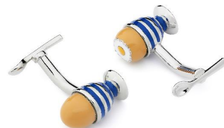
EGG AND SAUSAGE CUFFLINKS