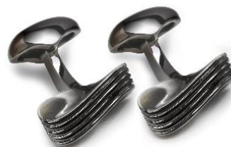
RIBBED KNOT CUFFLINKS Plated in various precious metals Rhodium C590RH Black C590BK