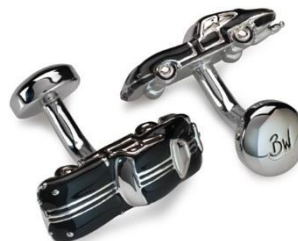
RETRO JAG CUFFLINKS Rhodium plated and enamelled cars Black C549BK