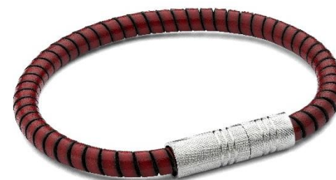
SCOOPY DOO BRACELET

Coloured rope with steel thread and push button steel clasp (6mm width)