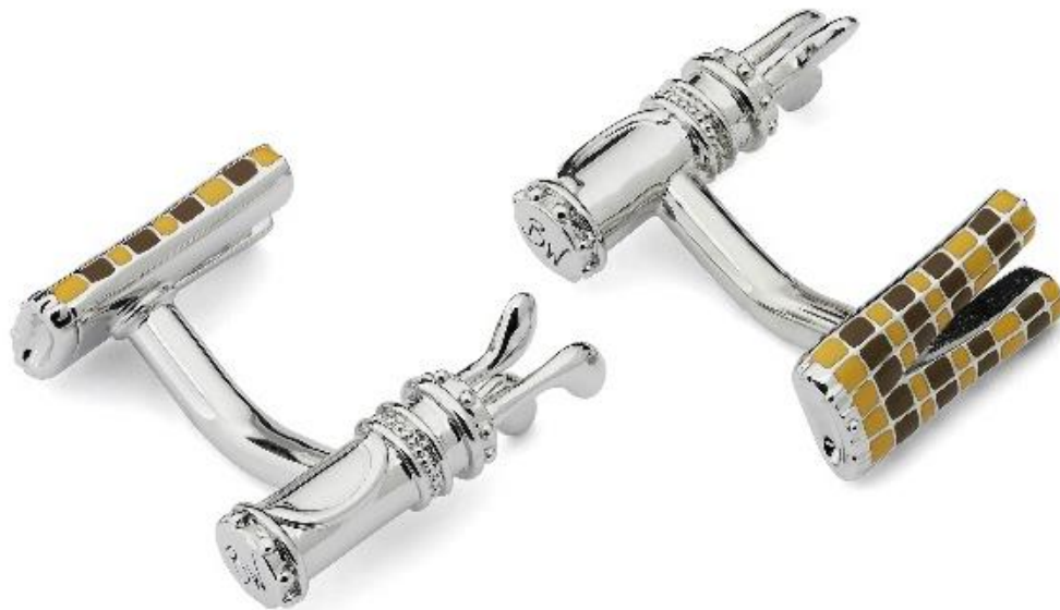
GOLF AND TROUSERS CUFFLINKS Hand enamelled plated in Rhodium Yellow & Brown C700Y