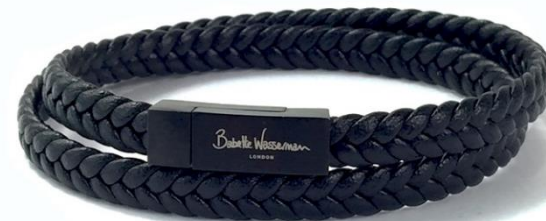
DEMON PLAIT BRACELET

Italian leather with Sterling Silver clasp Brown BR291BR