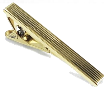
LINEA TIE BAR Plated with precious metals Gold TB045G