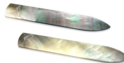
DECO LADY COLLAR STIFFENERS

Hand carved genuine Mother of Pearl CS003BKMOP