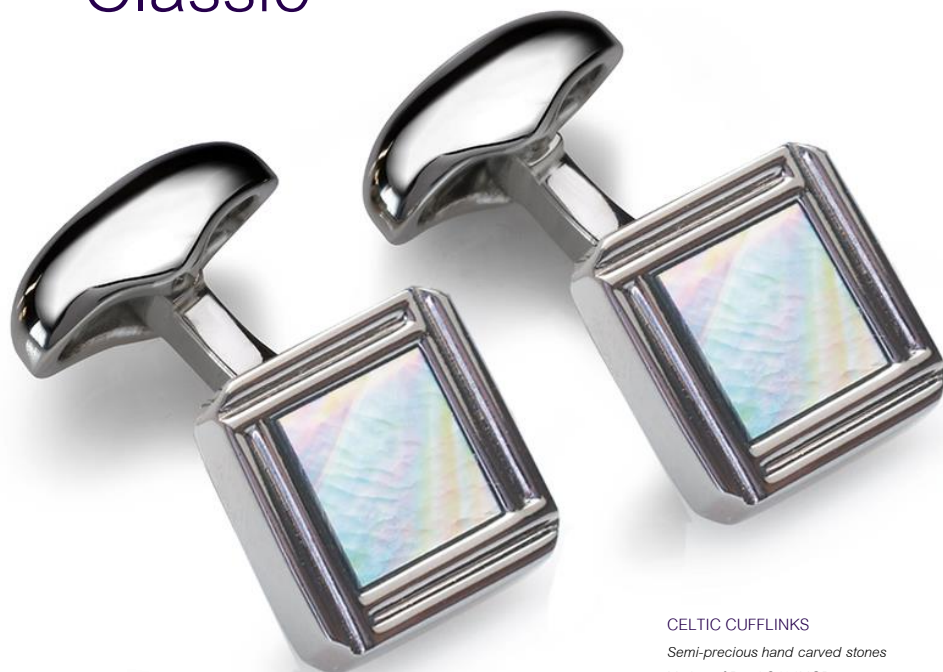
CELTIC CUFFLINKS Semi-precious hand carved stones Mother of Pearl C484MOP Onyx C484ON