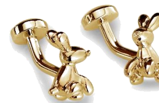
BALLOON RABBIT CUFFLINKS