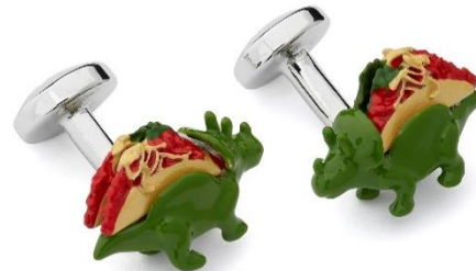
DINOSAUR TACO CUFFLINKS Hand enamelled plated in Rhodium C720