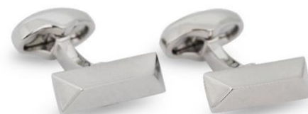
GEO PYRAMID CUFFLINKS Polished with one matt side Rhodium C637RH