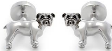
BULLDOG CUFFLINKS Rhodium Plated C562