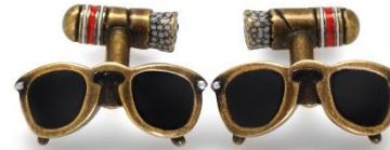
RETRO SUNGLASSES & CIGAR CUFFLINKS Rhodium plated with enamel C524