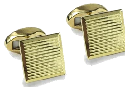
LINEA SQUARE CUFFLINKS Plated with precious metals Gold C722G