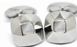
BULLION CUFFLINKS Semi-precious stones inset into Rhodium plated cufflinks Onyx C542ON Mother of Pearl C542MOP