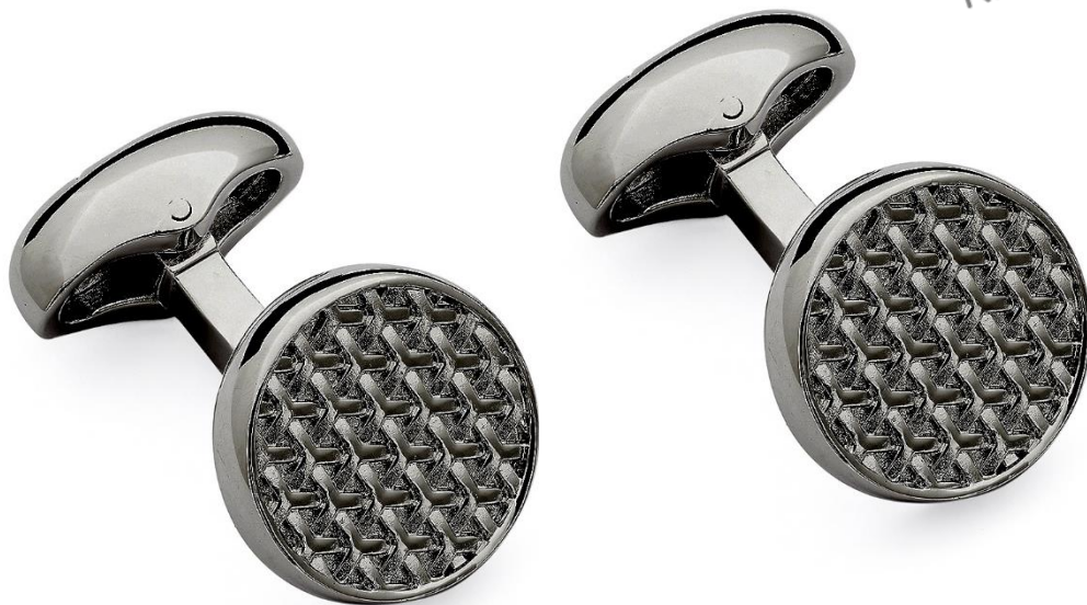
WOVEN ROUND CUFFLINK

Plated with precious metals Black rhodium C726BK Rhodium C726RH Rose Gold C726PG