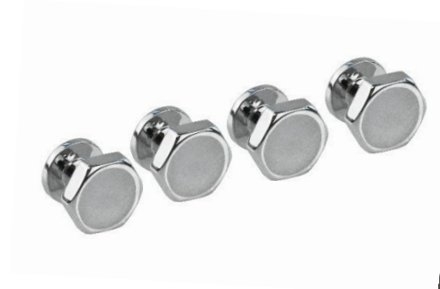
HEXAGON BUTTON STUDS Matt and shiny finish, a set contains 4 studs Rhodium ST001RH