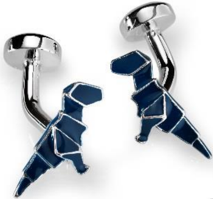
ORIGAMI DINOSAUR CUFFLINKS Hand enamelled plated in Rhodium Blue C631BL Rhodium C631RH