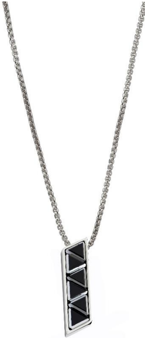
VENETIAN NECKLACE Rhodium plated with Swarovski NS463J