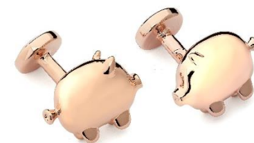
BALLOON PIG CUFFLINKS

Plated with precious metals Rhodium C719RH Black Rhodium C719BK Rose Gold C719PG