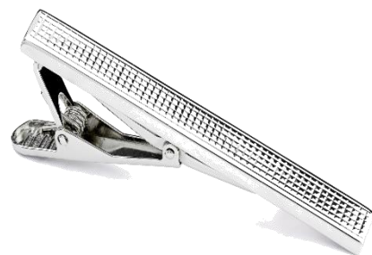
GATSBY CHECK TIE BAR Hand cut on a lathe and Rhodium plated TB043