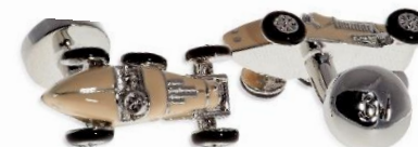
RETRO BUG CAR CUFFLINKS Hand Enamelled Rhodium plated Light blue C550LB Cream C550CR