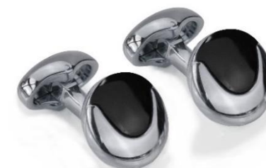
YING YANG CUFFLINKS Semi-precious stone hand carved Sodalite C669SO/RO Onyx C669ON/RH