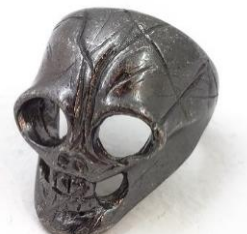
BIKER SKULL RING Antique black Rhodium plated finish RG265