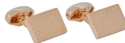
CLOVER TILE CUFFLINKS

Plated with precious metals Rhodium C726R Black C636BK Rhodium C636RH Rose Gold C636PG