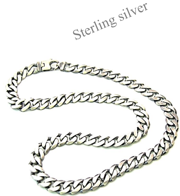
ROTTWEILLER NECKLACE Sterling Silver plate with an antique finish Black finish NS281