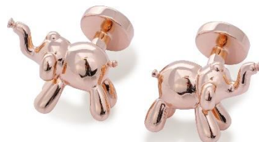
BALLOON ELEPHANT CUFFLINKS

Plated with precious metals Rhodium C675RH Rose Gold C675PG