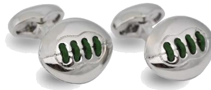
AMERICAN FOOTBALL CUFFLINKS Hand sewn with real leather and plated in Rhodium Green Leather C642G