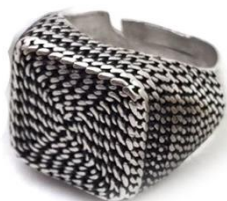
FIGARO SIGNET RING Antique black Rhodium plated finish Square ring RG267SQ Round ring RG267R