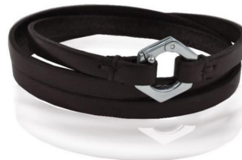
CABALLO HEXAGON BRACELET

Leather bracelet with a hexagon shaped Sterling Silver clasp