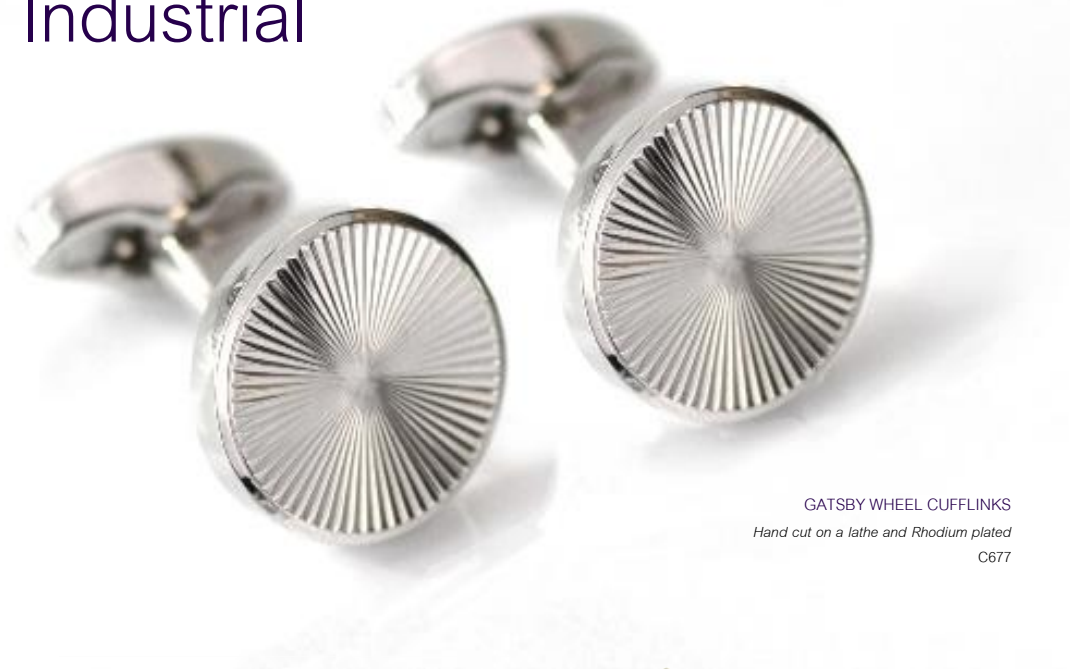
GATSBY WHEEL CUFFLINKS Hand cut on a lathe and Rhodium plated C677