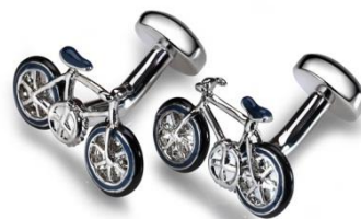
BICYCLE CUFFLINKS Hand enamelled Rhodium plated Blue C566BL