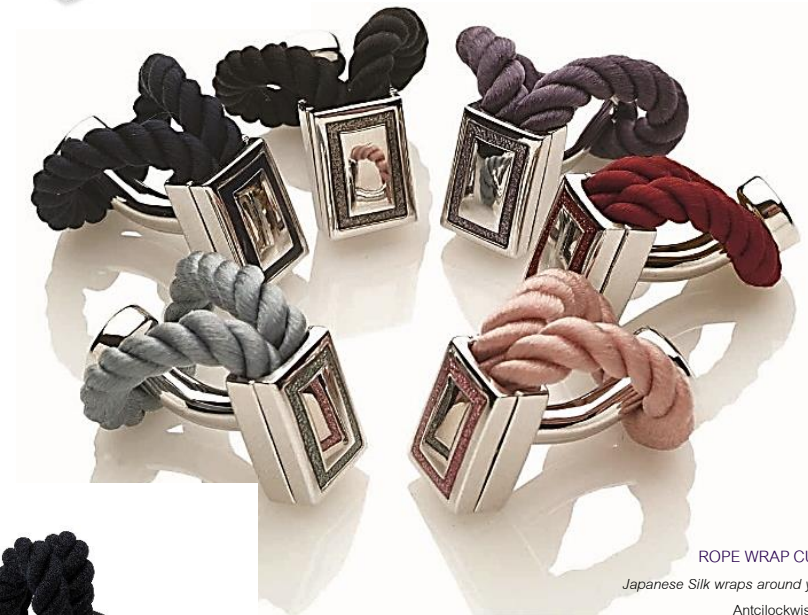
ROPE WRAP CUFFLINKS Japanese Silk wraps around your sleeve Anticlockwise from top: Navy C336N Light blue C336LB Pink C336PK Wine C336WI Purple C336P Black C336BK