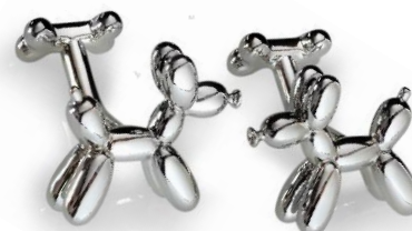
BALLOON DOG CUFFLINKS