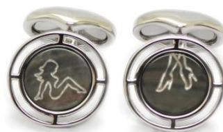
DECO LADY LEGS CUFFLINKS

Hand carved genuine Mother of Pearl CS003MOP