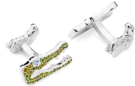
CROCODILE CUFFLINKS With a cowboy boot at the back Green C724