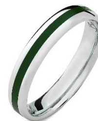
Hoola ENAMEL RING Sterling Silver hand enamelled with Rhodium plate Black RG270BK Red RG270RD Green RG270G