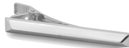
GEO PYRAMID TIE BAR Polished with one matt side Rhodium TB038RH