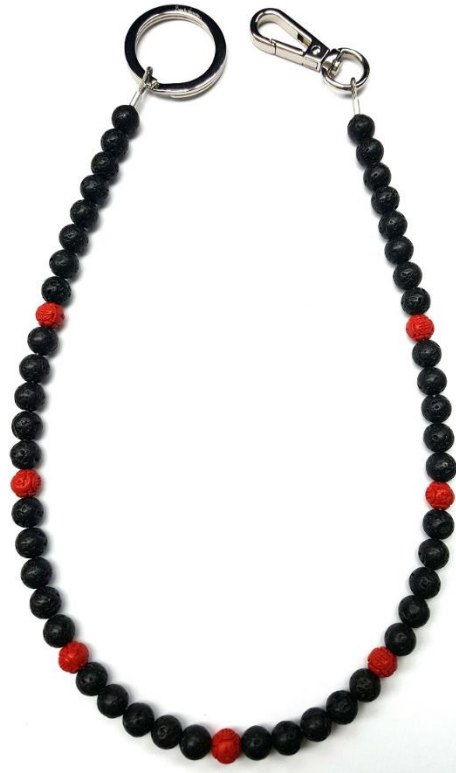
LAVA FOB CHAIN

Sterling Silver plate with an antique finish K019BK