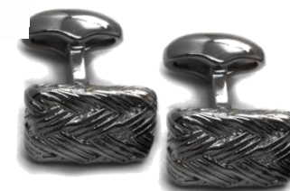
ROMAN CUFFLINKS Woven texture Black Rhodium C605BK Rose Gold C605PG Rhodium C605RH